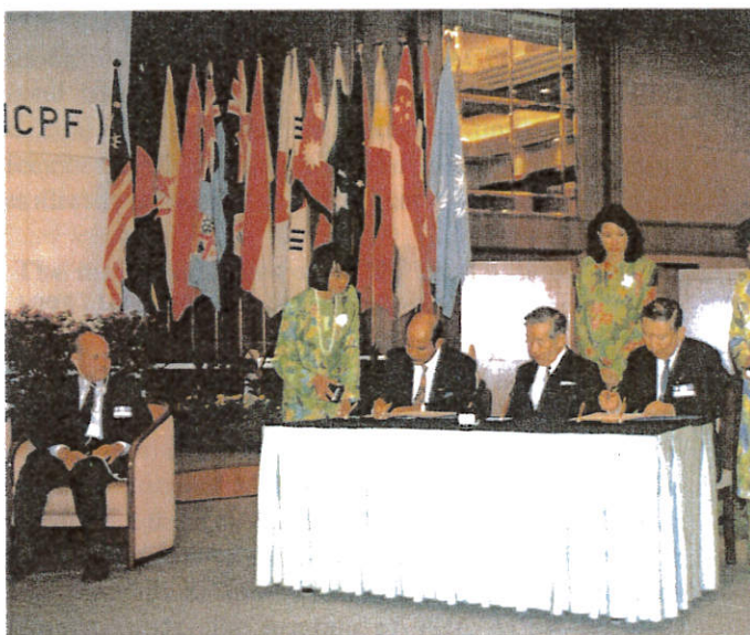
Signing Ceremony (Please see P. 11)