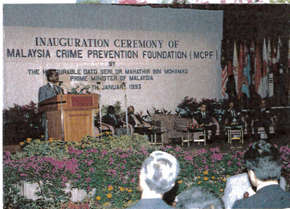
Congratulatory Address by Prime Minister of Malaysia Dato' Seri Dr. Mahathir bin Mohamad (Please See P. 11)