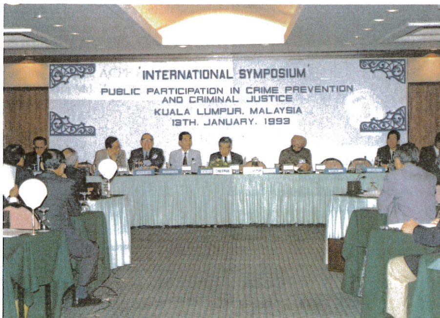
International Symposium (Please See P. 15)