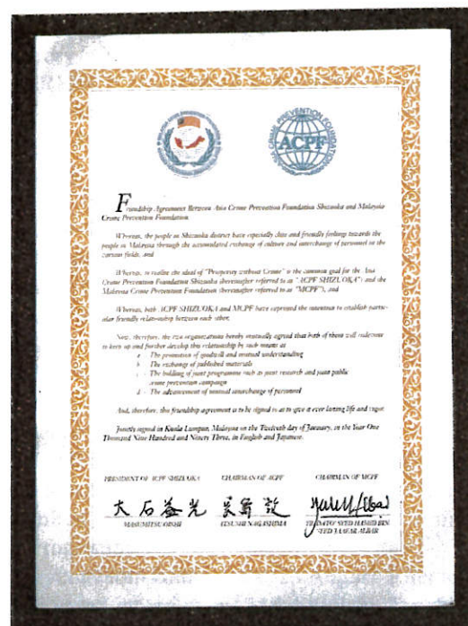
Memorandum of Friend Ship (Please see P. 11)