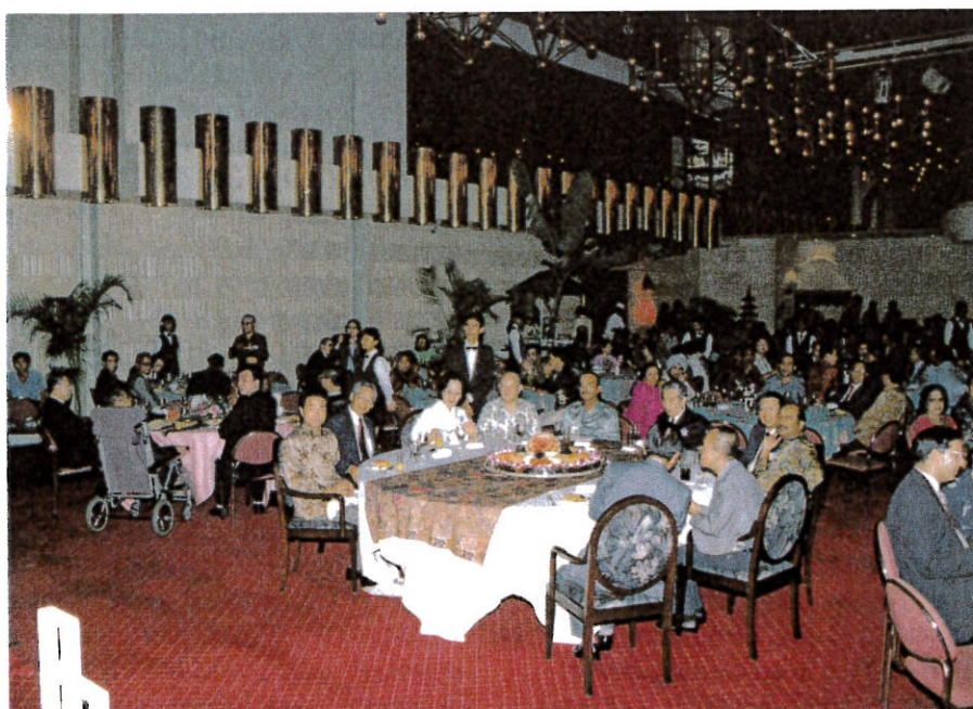
Tea Reception (Please See P. 11)